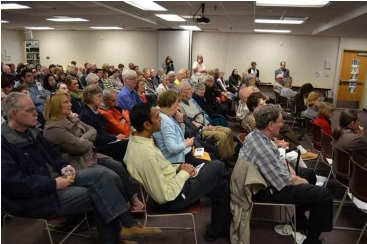
More than 150 people attended the unveiling of an exhibit about Muslims who saved Jews during the Holocaust and the invitation-only screening. The exhibit can be seen at the South Brunswick Public Library.